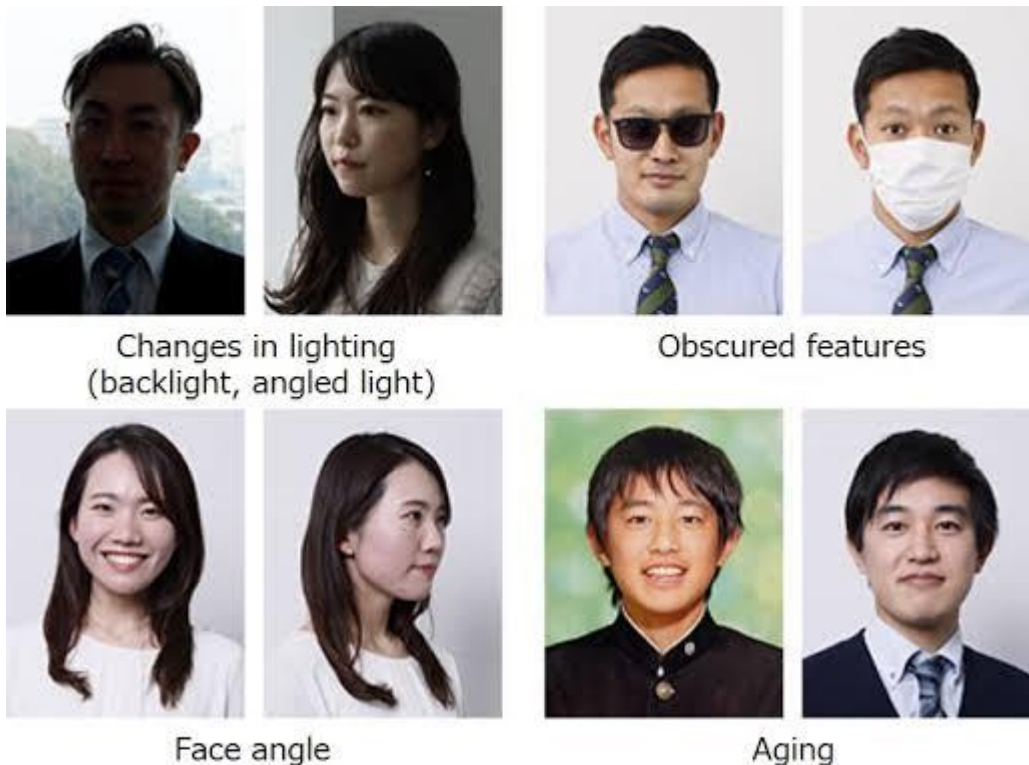
Image containing a face or multiple faces in a non-ideal condition as mentioned above. For example,