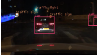
Target Domain: Image at night